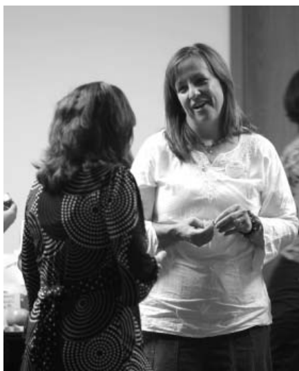
Enjoying food and conversation (above);